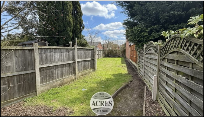
Mere Green Road, Sutton Coldfield, B75 5DD